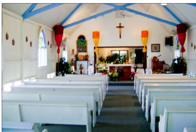
The sanctuary is decorated with kahili — symbols of royalty.