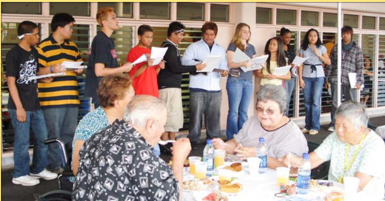
The Parish Youth Choir entertained at the Pre Thanksgiving Luncheon