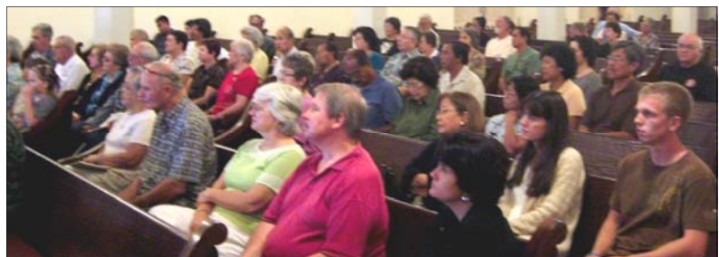
The Thursday, November 20 , Parish Hall meeting gave parishioners an opportunity to review the design plan options and to vote.