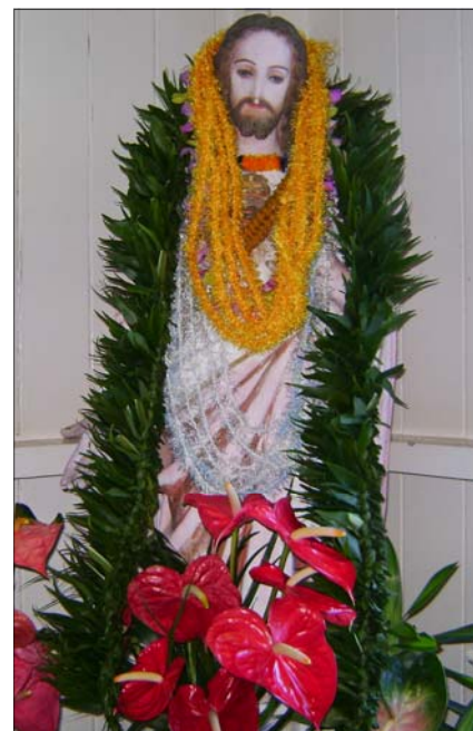
Christ the King gifted with leis.