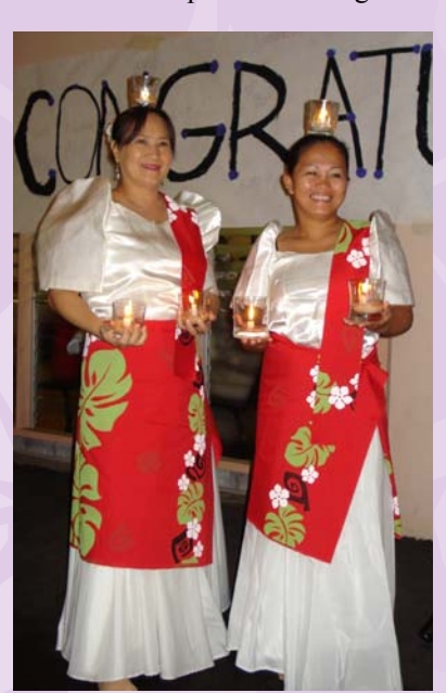
Visayan Dance Club provided very special entertainment.