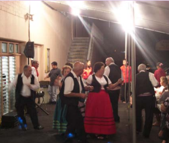
Portuguese Culture Club members perform a traditional dance.