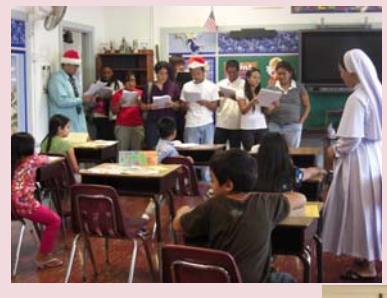
The Youth group carols at the R.E. classes on Sunday, December, 21