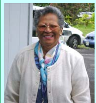
Aunty Babes Viveros Music Ministry