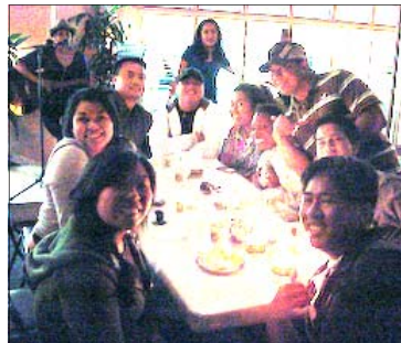
Parish youth and young adults pose for a quick photo as they enjoy Café Night.