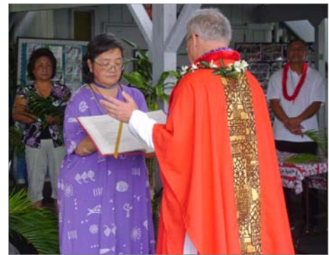
The Gospel before the procession.