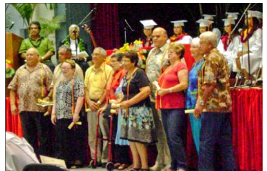
St. Joseph School chose to honor the class of 1959. They presented those present with a graduate pin, and red and yellow cord.