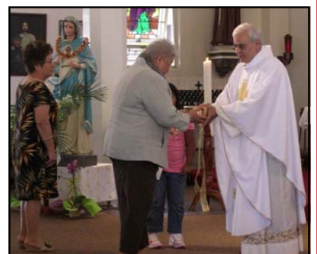
Ladies from the St. Joseph class of '62 & '63 attend the 9:00 am Mass at St. Joseph Church on May 24.