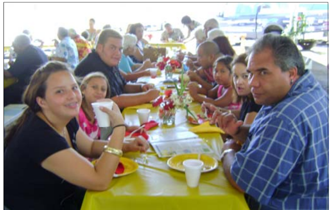
Cortez ohana share in the celebration.