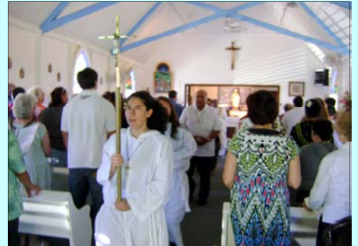
Ascension Sunday Mass