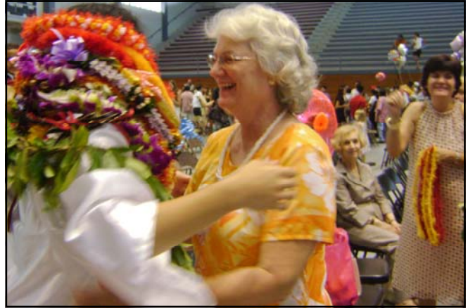
Congratulations and a hugs for the Graduate!