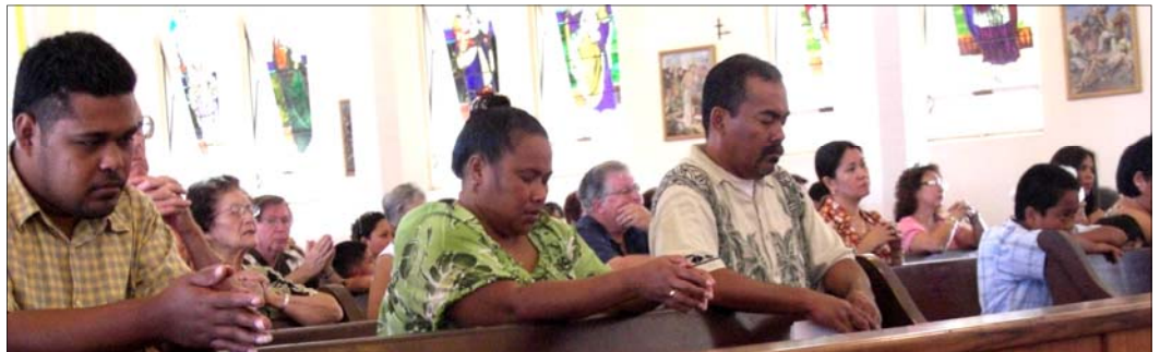
Remembering Christ's loving deeds and giving thanks and praise to God during the Liturgy of the Eucharist.