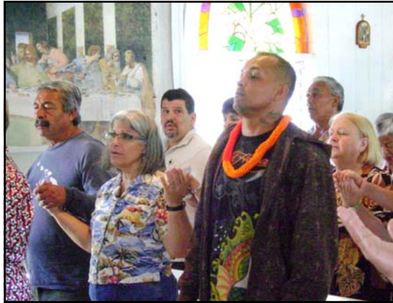
The Lord's Prayer shared at Mass.