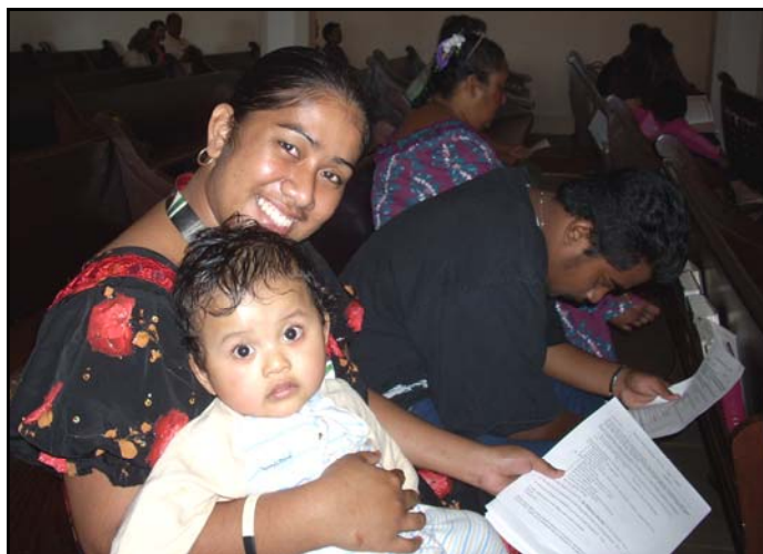
Parishioners at 7 pm Mass St. Joseph Church