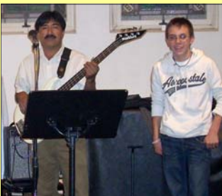
Spanish Mass Musicians