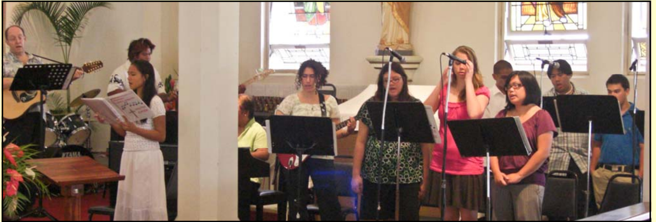
Youth & Young Adult Choir