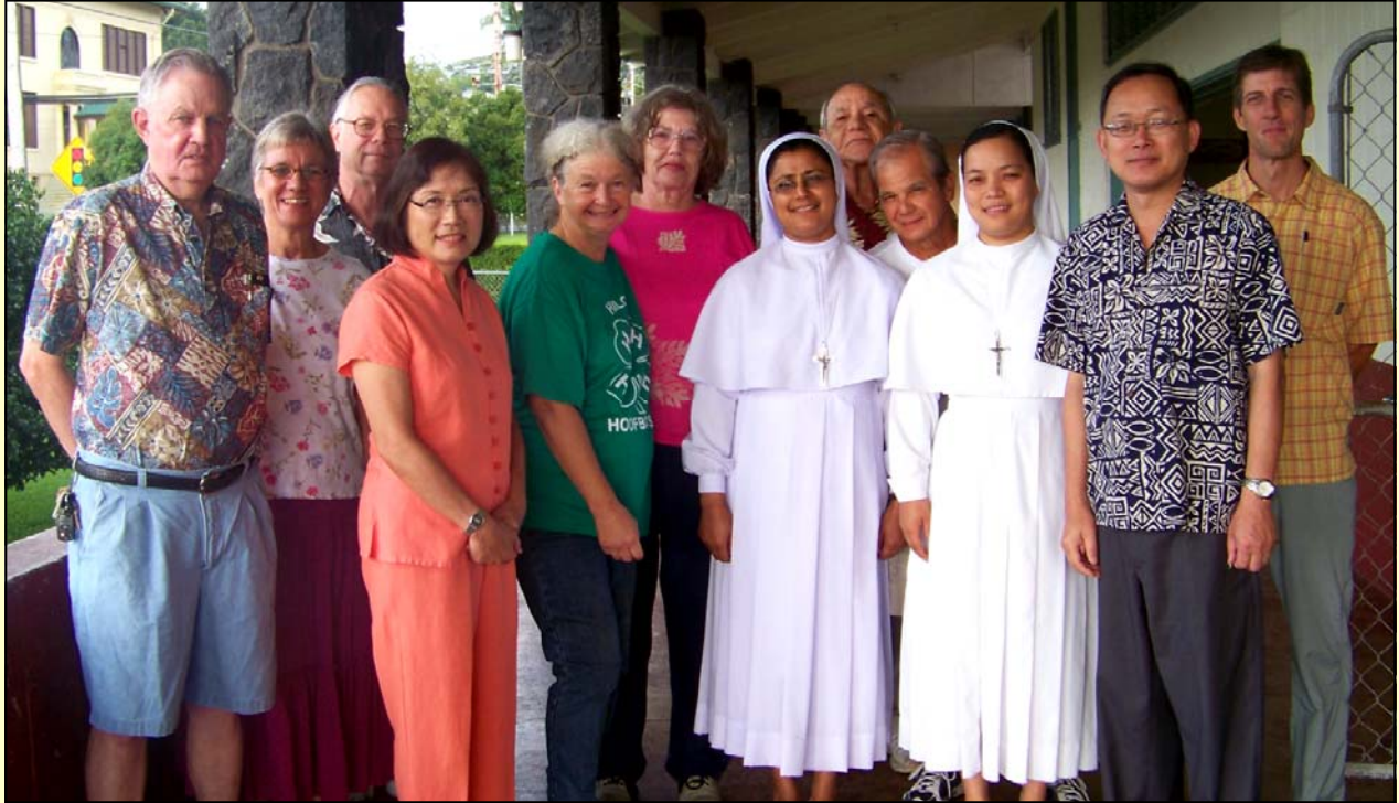
Group photo of Interfaith Community volunteers who participated in the prayer breakfast.

A Prayer Breakfast & fellowship , with our brothers & sisters of many faiths, who are struggling together in these difficult times, was held at the Methodist Church on Saturday, June 27.