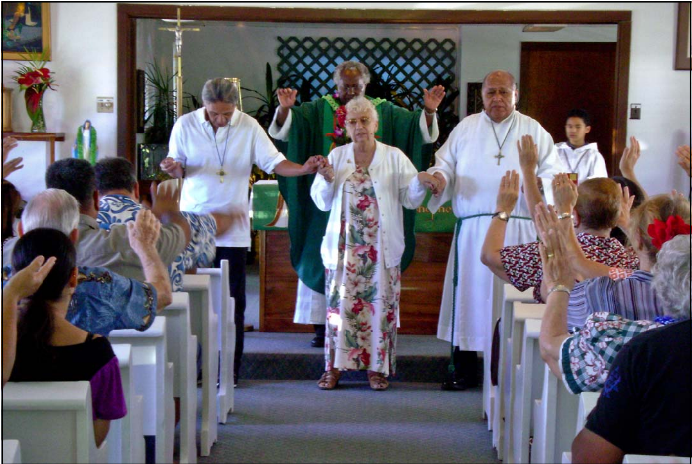
Sending forth the Eucharistic Ministers to homebound parishioners.