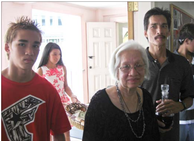
Bringing up the Gifts