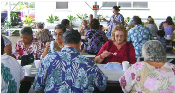
Parishioners share fellowship after Mass.

KU'IA KA HELE A KA NA'AU HA'AHA'A. Teach me to be humble, and in all things to seek the honor of God & to bear with patience the crosses of life.