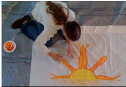
Malia parishioners creating banners for the Advent & Christmas Liturgies.