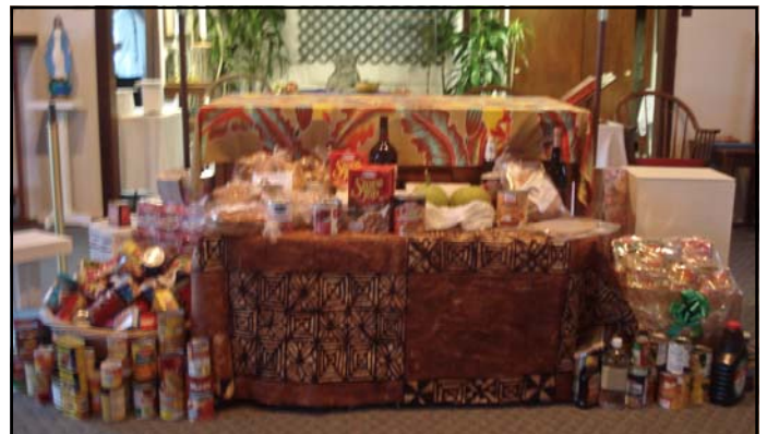
“Malia parishioners bring food at Thanksgiving to feed the hungry.”

We will have our monthly communal penance service on Saturday, Dec. 19 at 8:30 am. Please be aware that the service begins promptly at 8:30. In November, some people came a little late and it was over! This is a communal penance service with the opportunity for individual confession and absolution. THIS IS NOT A TIME FOR INDIVIDUAL COUNSELING AND/OR SPIRITUAL DIRECTION. If you are seeking counseling and/or spiritual direction, please call the parish office and make an individual appointment.