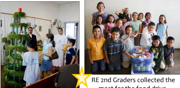
★ RE 2nd Graders collected the most for the food drive.