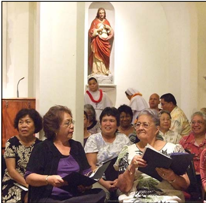
St Joseph Choir members