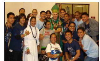
2009 Diocesan Youth & Young Adult Rally Participants

Let's grow something beautiful and pleasing to God...how about something like your faith life?