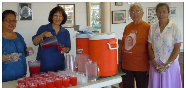
Volunteers at the Hot Meal. 222 persons were served during the August Hot Meal.