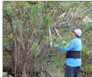
Aloha Outreach Ministry Serving the elderly