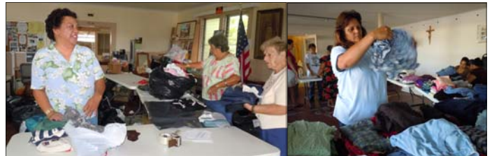
Volunteers sort items for the up coming Rummage Sale.