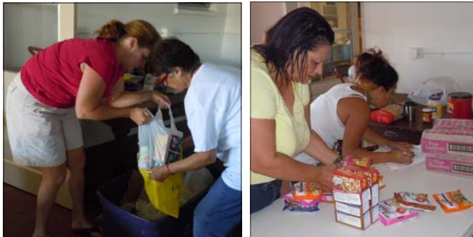
Volunteers working at the food pantry