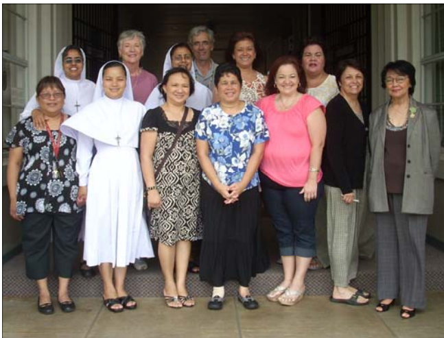
Catechism teachers of 2009 August to 2010 May

The Scholastic year of Religious Education program will come to an end on Sunday, May 23, 2010. My sincere thanks to all the catechists of St Joseph Parish for your cooperation in the faith formation of our kids.