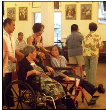
Special Needs Mass on Sunday, May 16, 2010, at 6 pm