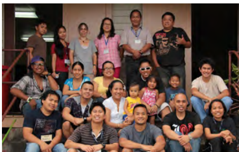
Young Adult Participants and Facilitators who came to hear God’s Word, fellowshiped with the community and “experienced Christ”

ALL ADULTS ARE WELCOME to be apart of this community. Single, Married, with or without children, Widowed and Divorced. This community welcomes YOU!