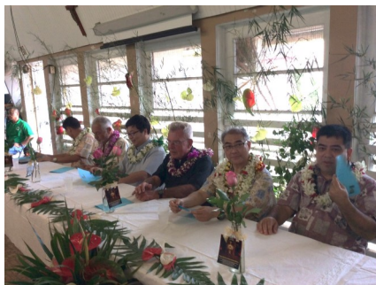
Clergy from the East Hawaii Vicariate