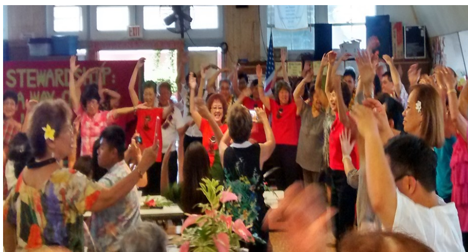
Everyone joined in a line dance!

We are a welcoming parish. Be a family member, today!