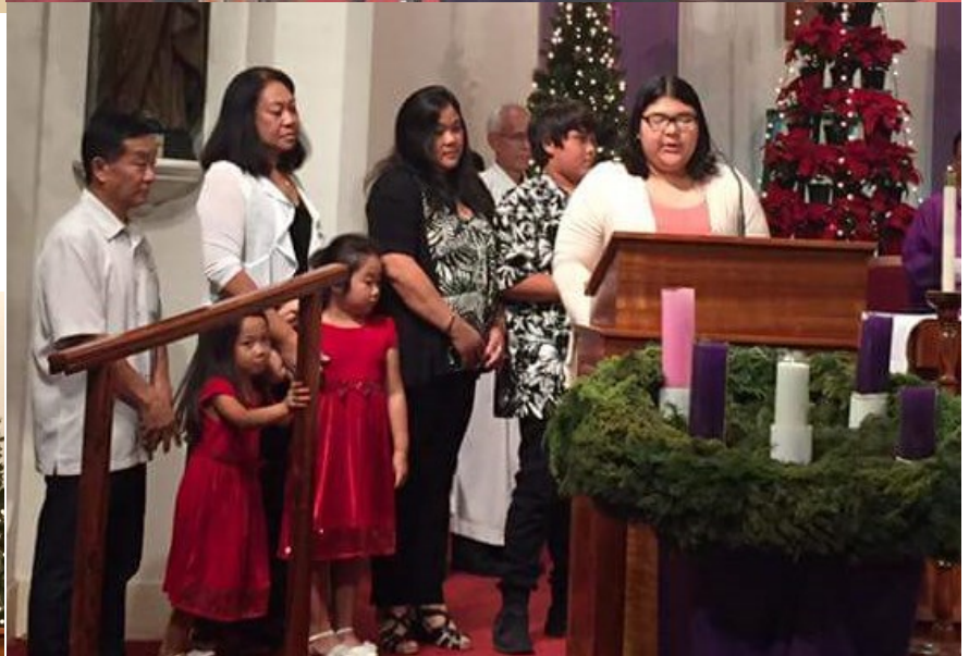
Religious Ed families participate in the Advent Wreath Candle Lighting during Simbang Gabi Masses