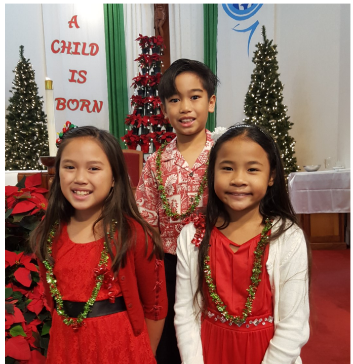
Children's Trio sang silent night at the 9am mass on Christmas day.