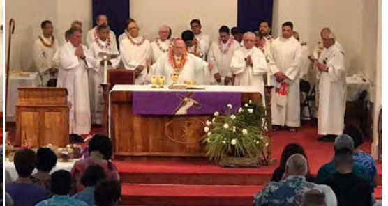
The hosting parish receives their oils and are placed immediately into the ambry. The liturgy of the Eucharist completes the evening and the celebration ends. Next year, West Hawaii parishes will host the annual Chrism mass.