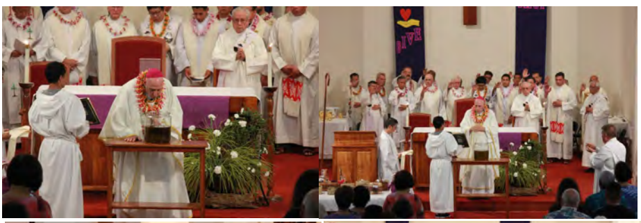
Members of the Bible Sharing ministry assist by distributing the Chrism oil to all the parishes on the Big Island.