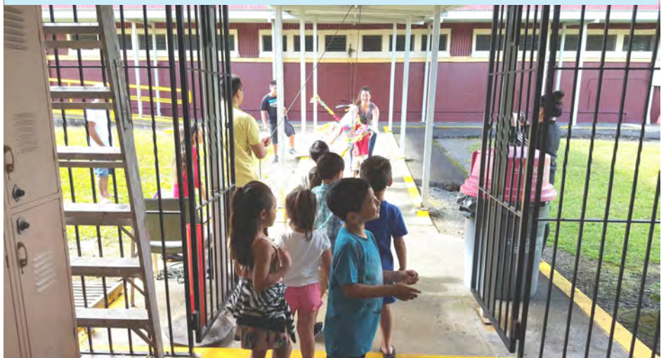
The Parish Kindergarten class celebrated the "Feast of the Magi" with an Epiphany party. Parents & Grandparents joined in on the fun with a Trivia game, a Paper Snowball fight and a Piñata. (picture on left & above)