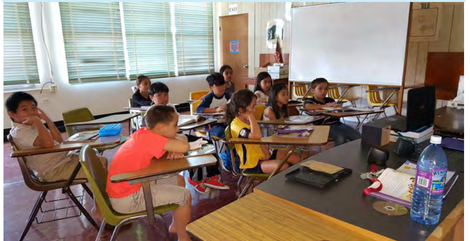
First Communion-Year 2 class views a video on "How to make a Good Confession" as they prepare for their First Reconciliation. (picture above)