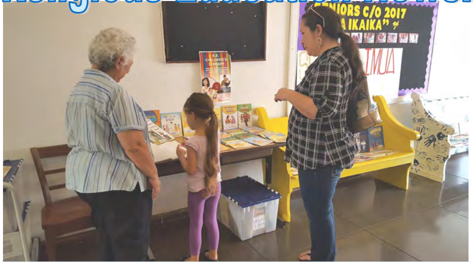
Student from the First Communion-Year 1 class borrows a religious children's storybook from our Parish Children's Library. (picture above)