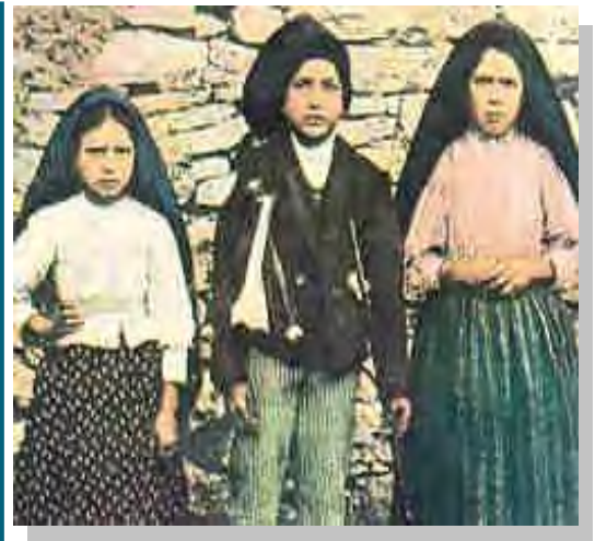
Blessed Francisco, Blessed Jacinta, and Sister Lucia