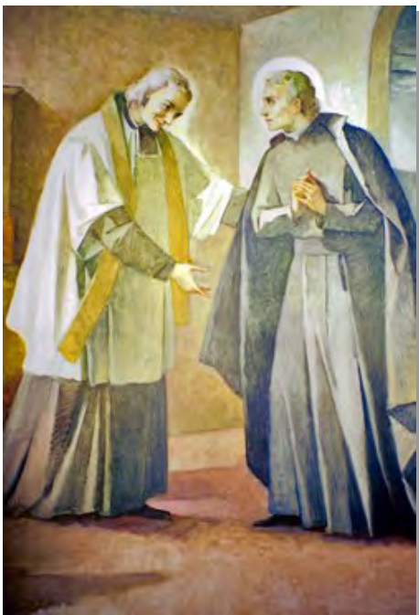
Father Eymard & Archbishop Sibour

It began with a chance encounter and an unshakable sense of call.