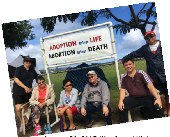
January 21, 2017 (Bayfront, Hilo)