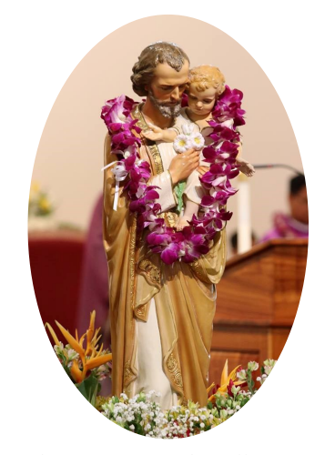
Please remember St. Joseph Parish in your will!

5 pm Saturday Vigil Mass 7 am, 9 am, 11:45 am and 6 pm Sunday