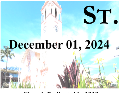
Church Dedicated in 1919