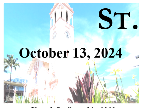
Church Dedicated in 1919