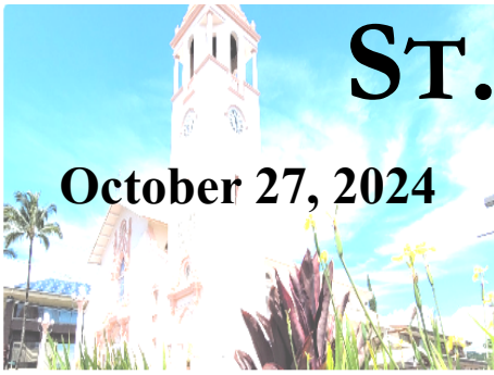
Church Dedicated in 1919