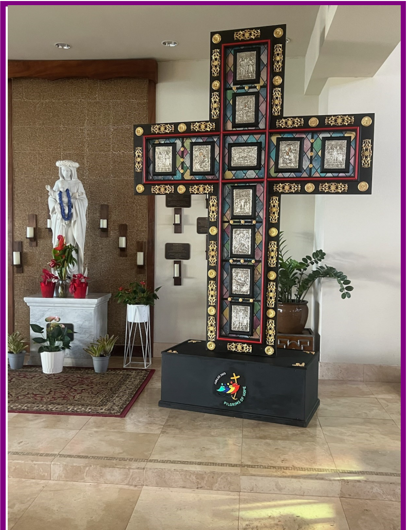
The Jubilee Cross, installed at the co-Cathedral. A smaller version of this cross will be coming to the Big Island on February 28th and will tour the Churches here.

Paper 5-part Luau plates 3-section To-Go Containers, Napkins, Paper Drinking cups, Utensils (compostable)