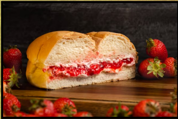
STRAWBERRY CREAM- CHEESE